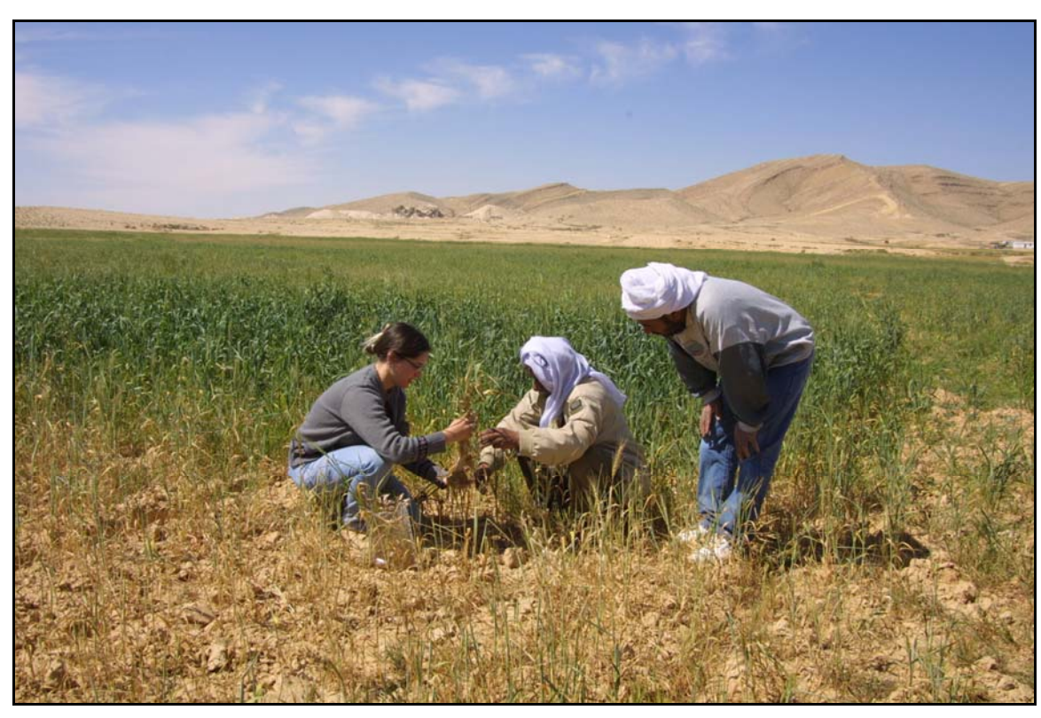
Crops destroyed after spraying operation Abda, 4.3.2003