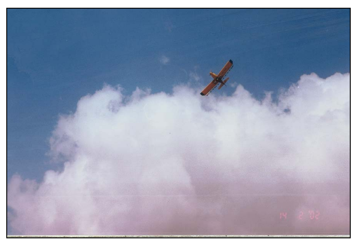
ILA crop duster during spraying operation Al-Makiman Uajan, 4.2.2002