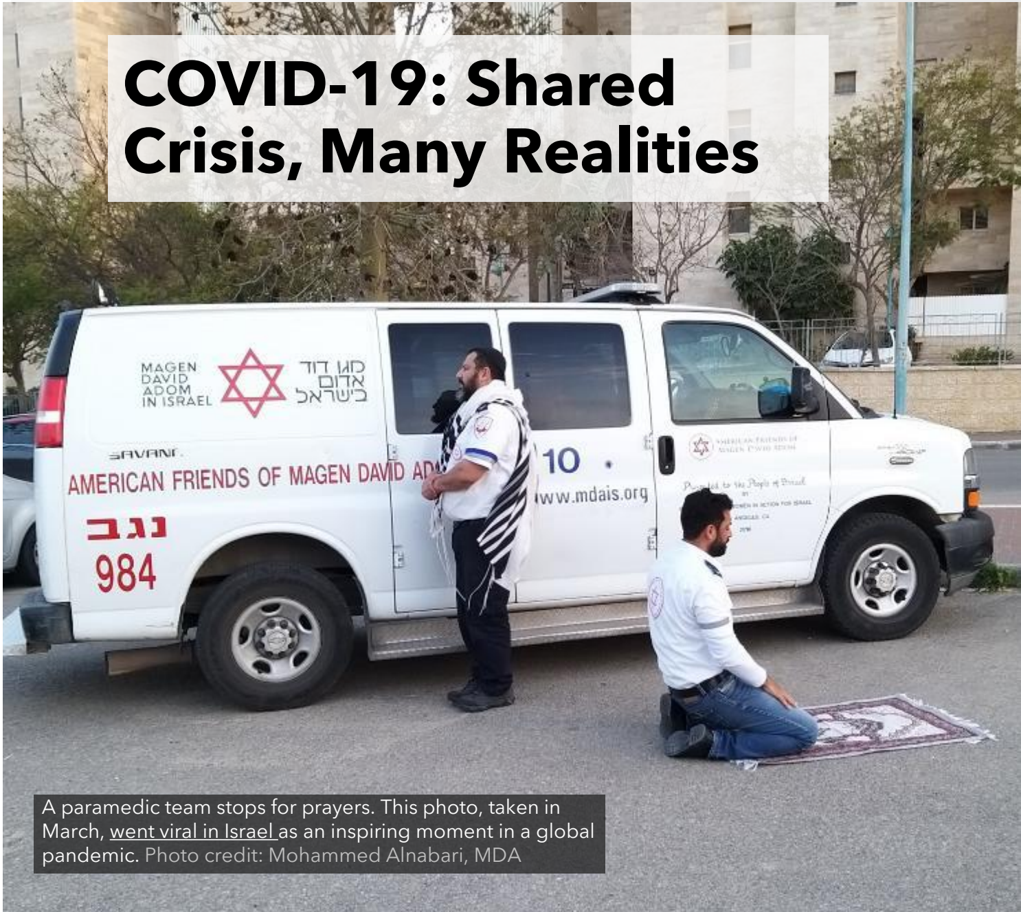
A paramedic team stops for prayers. This photo, taken in March, went viral in Israel as an inspiring moment in a global pandemic.