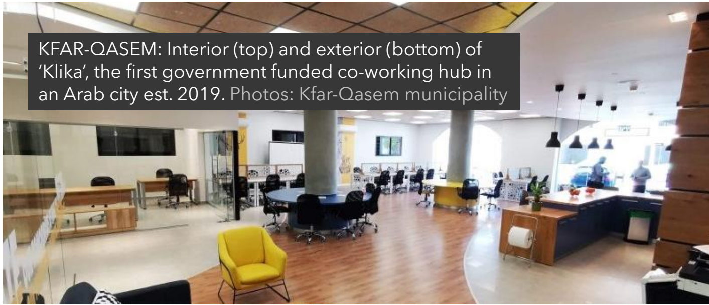
KFAR-QASEM: Interior (top) and exterior (bottom) of 'Klika', the first government funded co-working hub in an Arab city est. 2019.